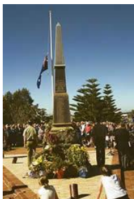
Flag at half mast at the cenotaph in Ulladulla, NSW. ANZAC Day 1999.

For information about Australian national flag protocol, please visit It's an honour , a web site managed and maintained by the Department of the Prime Minister and Cabinet.