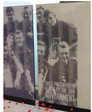
ARMY Panel Number 22 - Panel background - Soldiers receiving a gift of dolls from the SVN Government