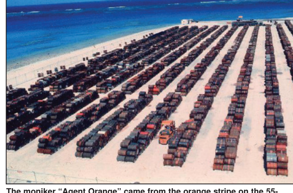
The moniker "Agent Orange" came from the orange stripe on the 55gallon drum containing the dioxin-laden material.

ters, downed [crashed in combat areas]." Note the "planes" (C-123s) and helicopters were spraying Agent Orange. Because the mission was classified, there is no record of his involvement; traditionally, the military does not keep any records of classified activity. He currently has ten of the diseases (conditions) attributable to Agent Orange. Because his mission was classified, he has been denied all medical services - they have no record of his being in Vietnam. Unfortunately, this is NOT an isolated example.